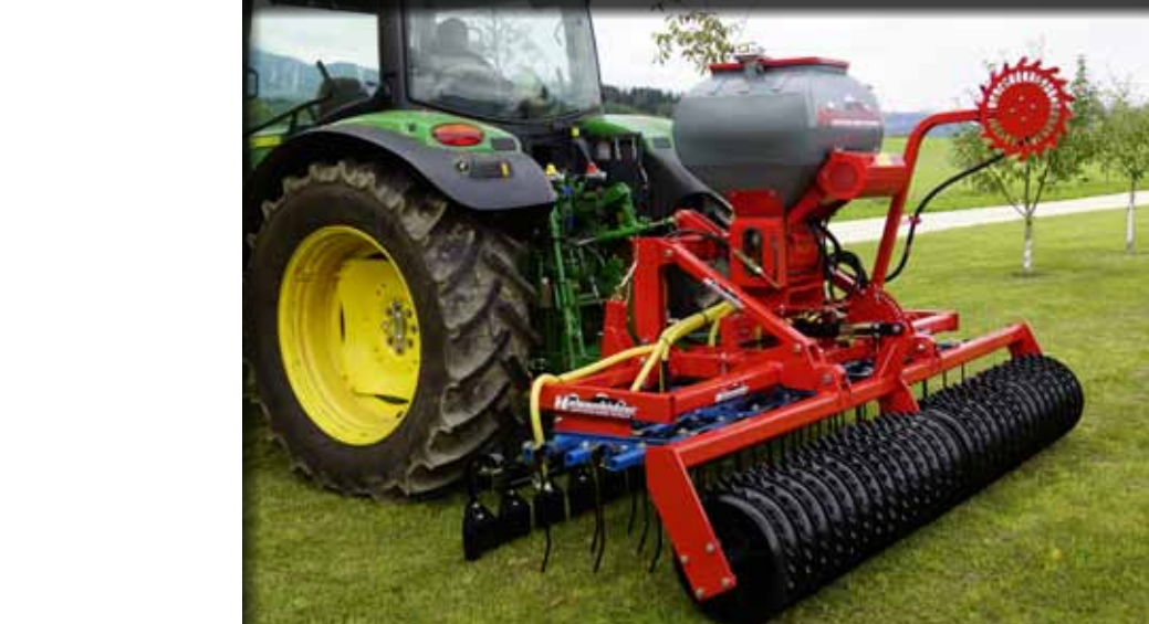
Vertikator schwere Ausführung mit Planierschild und 10mm Zinken

Vertikator "Hegler Sepp", strong version, 6m working width