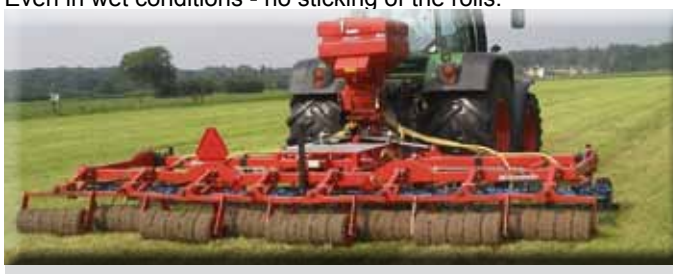
ertikator 6m working width with pneum, Seeder "Air 16

The special pressure rollers behind the harrow and the pneumatic Seeding machine complete the perfect pagination loose pasture renewal. The more divided pressure roller presses the seed and results in good soil contact. The pressure roller is characterized by excellent ground, even on the most difficult terrain. Even in wet conditions - no sticking of the rolls