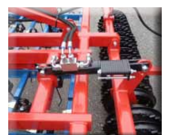
Hydraulic depth adjustment

The planting unit is the pneumatic Seeder "Air 8".