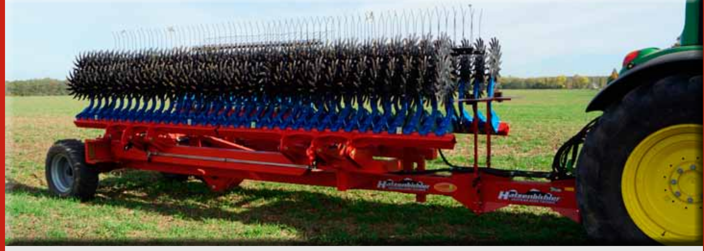
Rotary-Hoe 12,20m working width in working position and transport position