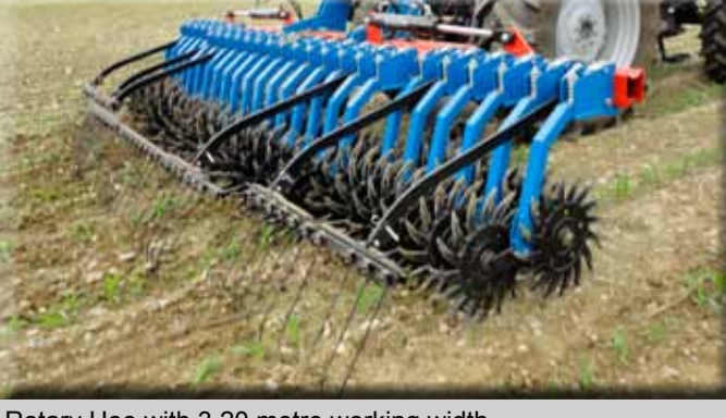
Rotary Hoe with 3,20 metre working width